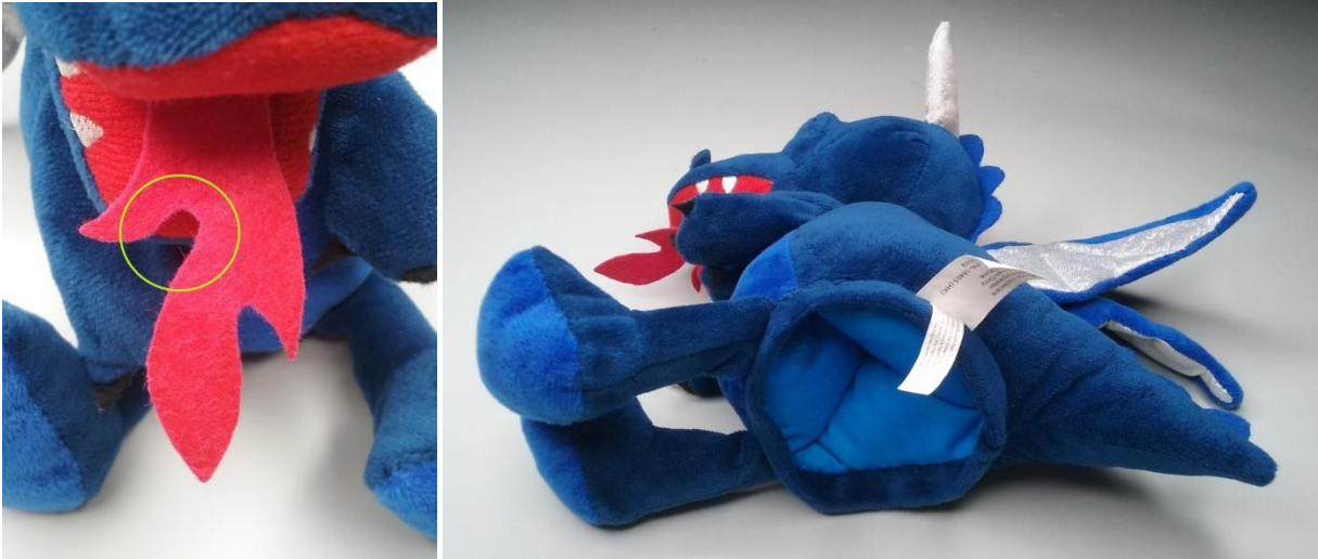
Below: Overview of Cuddly Blue Dragon at the conclusion of this treatment.